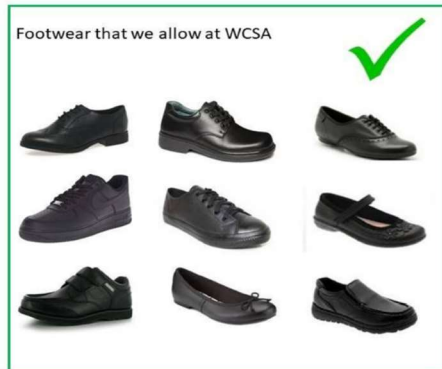
Footwear that we allow at WCSA

School shoes should be ALL black (no white or coloured logos).