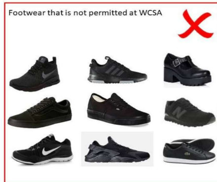
Footwear that is not permitted at WCSA

School shoes should be ALL black (no white or coloured logos).